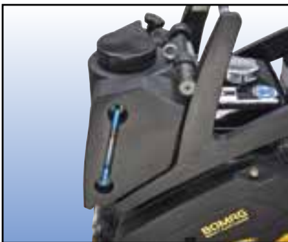
Removable water tank with level gauge.