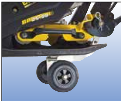
Easy jobsite movement with transport wheels.