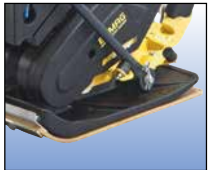
Protection for paving stones by the Vulcolan mat.