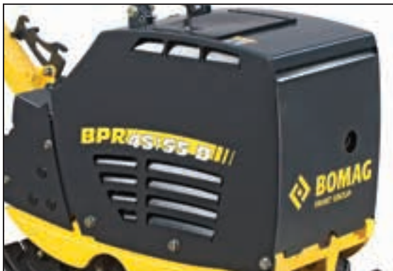
Fully closed hood for maximum protection and lower repair costs.