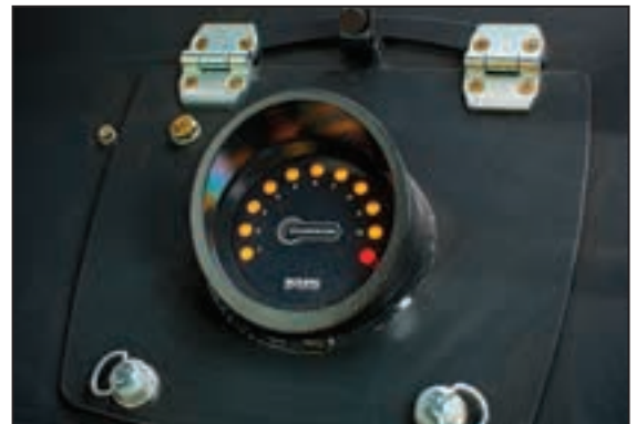
BOMAG ECONOMIZER - An optional soil stiffness indicator providing greater productivity and reduced machine wear.