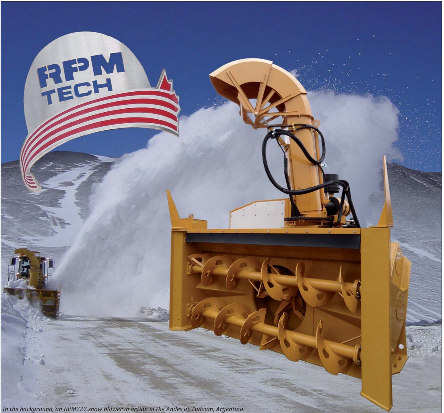
In the background, an RPM227 snow blower in action in the Andes at Tudcum, Argentina.