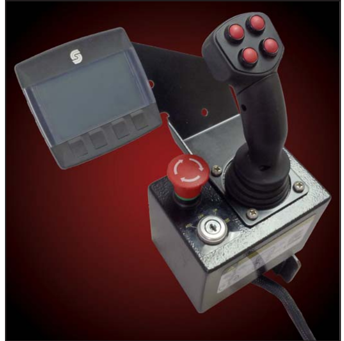
HIGH RESOLUTION GRAYSCALE LCD DISPLAY AND PLUS +1 JOYSTICK FROM SAUER DANFOSS