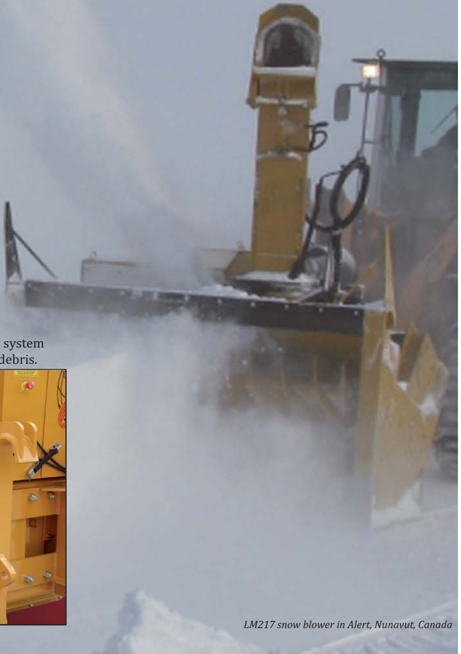
LM217 snow blower in Alert, Nunavut, Canada