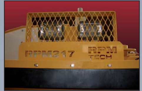
Two optional work lights can be installed on top of the snow blower body to improve visibility during snow removal operations.

Two sets of shear bolts protect the impeller and the augers and are easily accessible for maintenance.