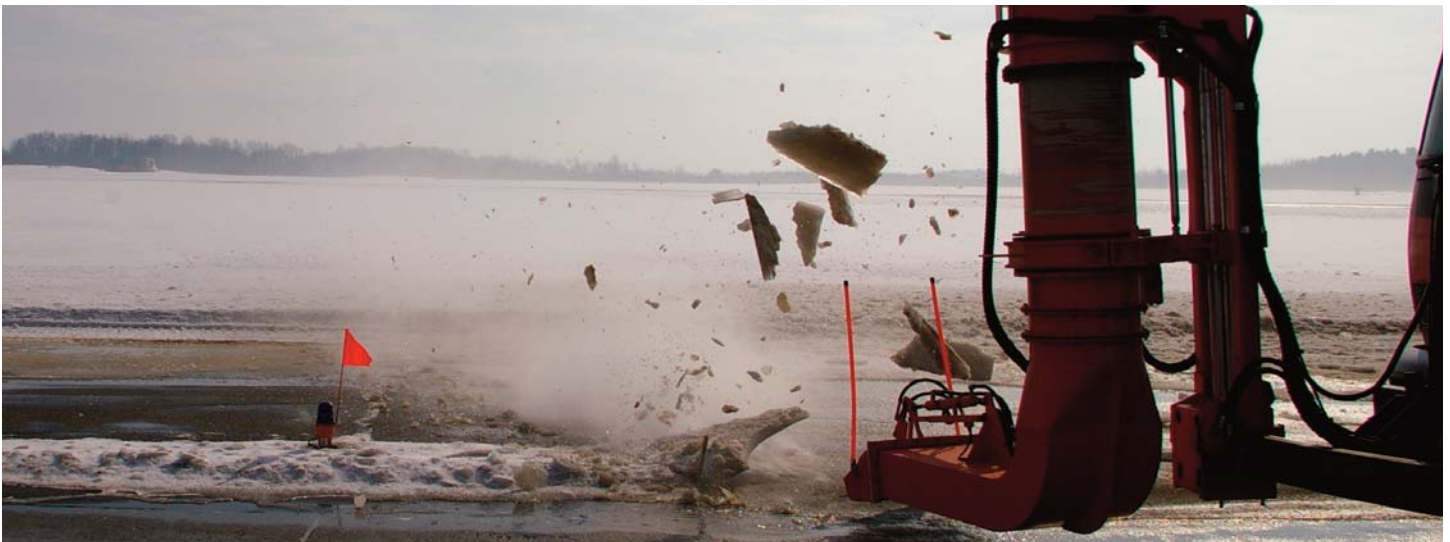
The AF1 cold air blower clearing ice and snow at Mirabel Airport, QC, Canada.

During the winter months, runways are vulnerable to snow and ice – each of which can significantly reduce what is known as the runway tolerance. This is the degree to which a landing aircraft can stop without sliding, and a plane taking off needs a similar level of grip in order to generate the speed needed to get off the ground.