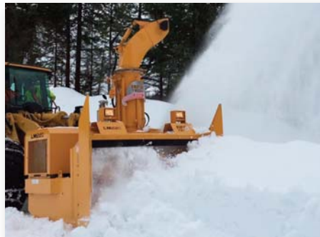
LM220 - Detachable snow blower