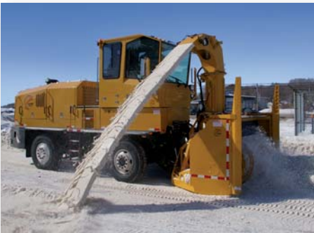
TM42R - Self-propelled snow blower