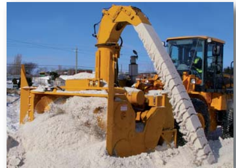
RPM227M - Detachable snow blower

Note: The carrier unit may differ from the ones shown in this brochure.