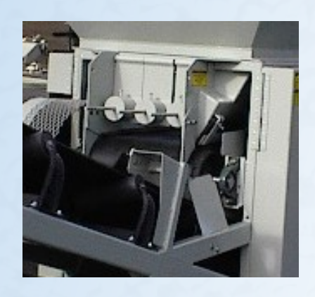
24"x5' belt feeder hopper has adjustable weighted feed gate.