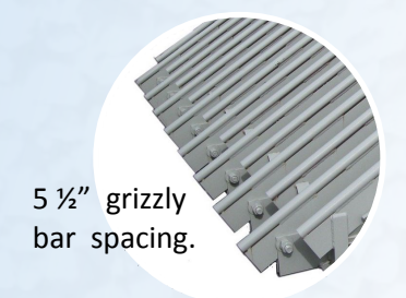
Separating grid grizzly is easily cleared by lifting the grizzly which allows rocks to dislodge.