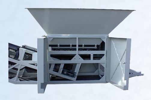
Large access doors for maintenance.