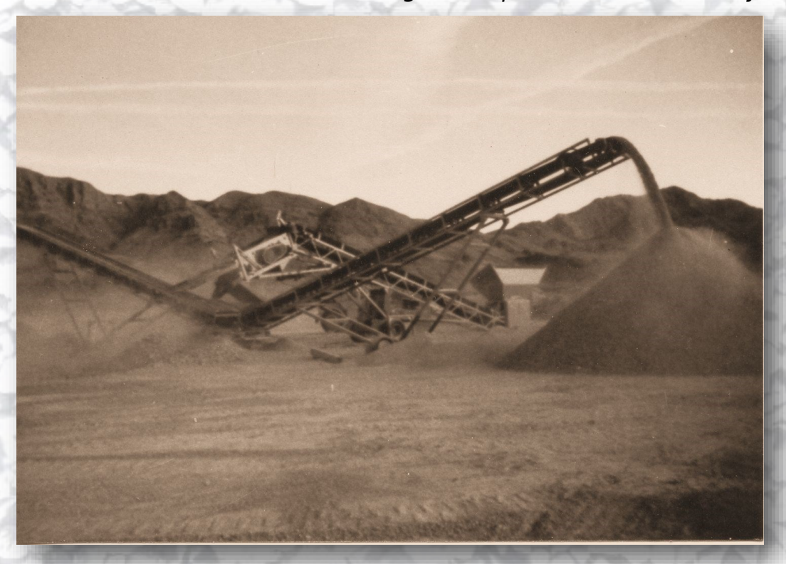
For over 25 years the Fab Tec Pro Screen has been proving itself in the field with production rates up to 240 TPH producing 3/4" minus.

The Fab Tec Pro Screen combines the best design features with attention to detail by skilled fabricators— and adds high quality, readily available components for an exceptionally efficient, cost effective piece of machinery.