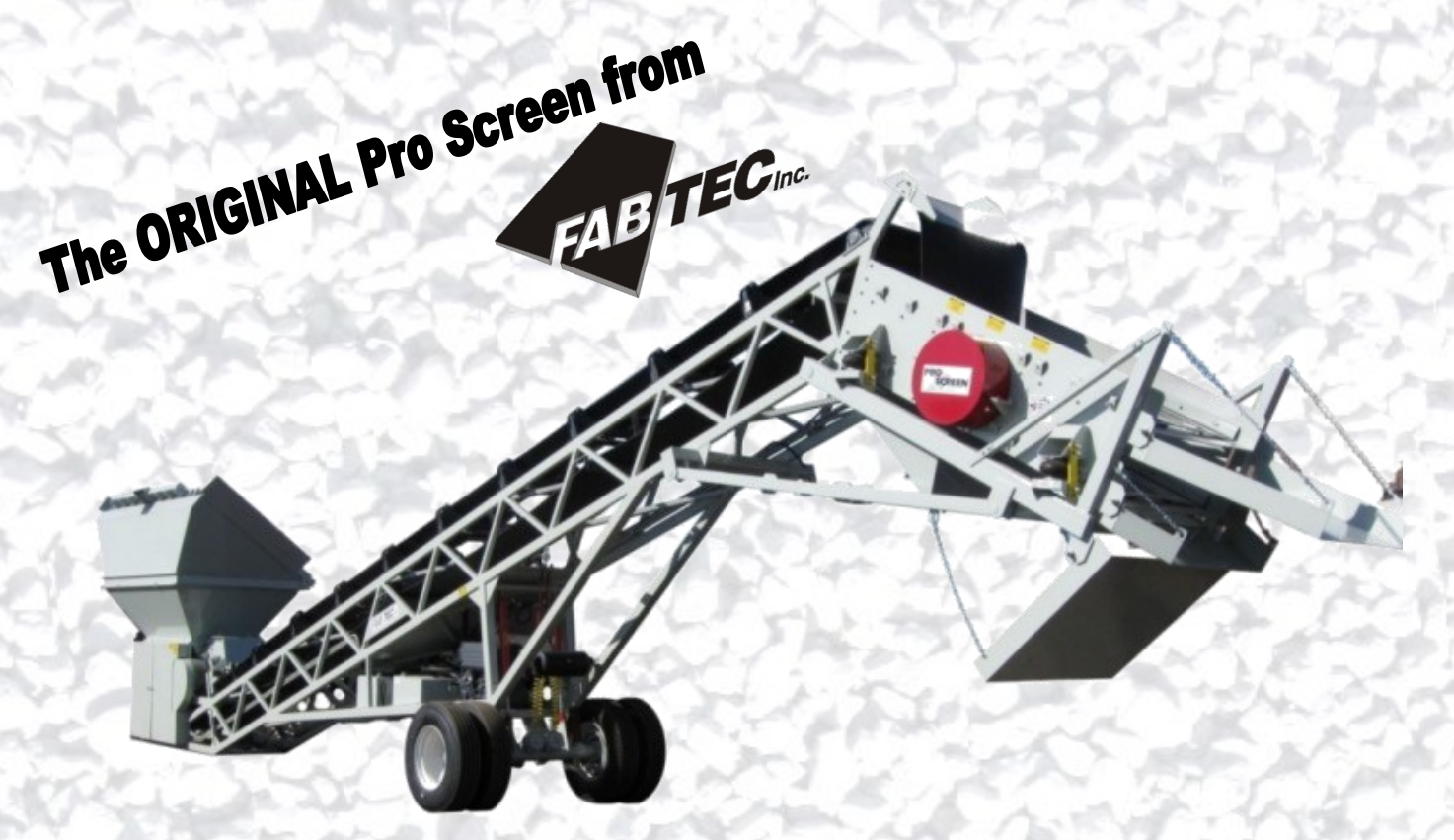
Fab Tec has been manufacturing "Quality Equipment Built Tough" since 1988 and the Fab Tec Pro Screen has been earning that reputation from the very beginning.