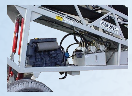
Deutz F4L2011 air cooled diesel has 55 hp at 2100 rpm